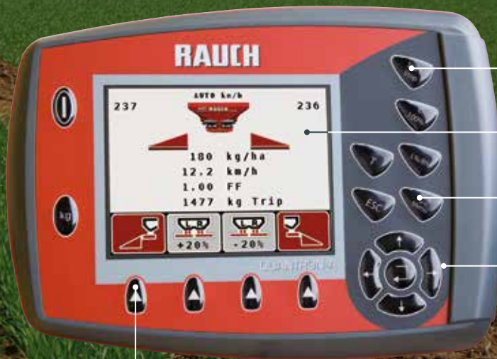
VariSpread functions left/right