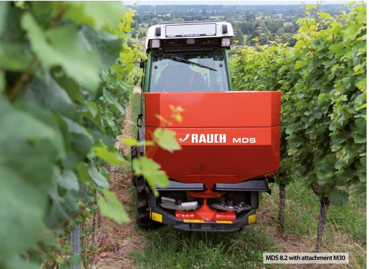
MDS 8.2 with attachment M30

MDS spreaders are indispensable for professional use in fruit, wine or hop cultivation and are perfectly prepared for this task with innovative detailed solutions.