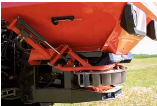
TELIMAT, boundary spreading from the machine track

GSE 7 is a manually operated boundary and edge spreading device that enables one-sided (to the left or right) sharp-edged spreading directly from the field boundary. The equipment can be remote controlled on request and can also be combined with TELIMAT.