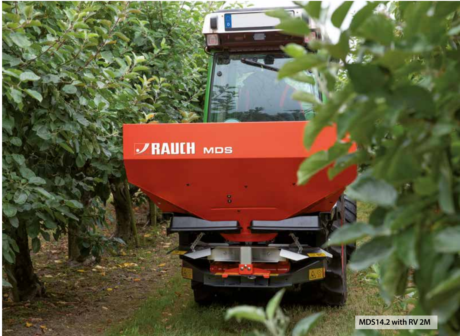
MDS14.2 with RV 2M