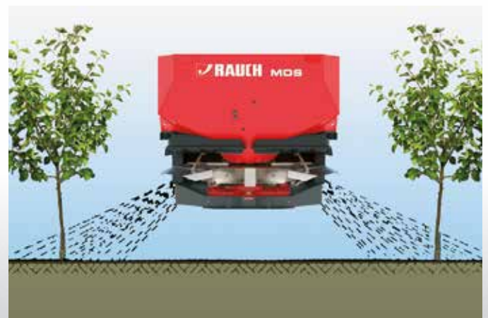
Mode of operation of the RV 2M series spreading device

The RV 2M row spreading device enables selective nutrient application in the root area of row crops. No granulate falls into the machine track. This saves valuable fertiliser and spares the environment. RV 2M can be easily and variably adjusted to row distances between 2 and 5 m.