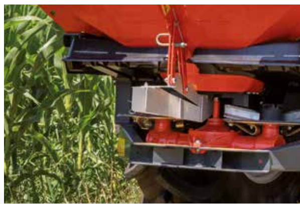
GSE 7, boundary spreading from the field boundary