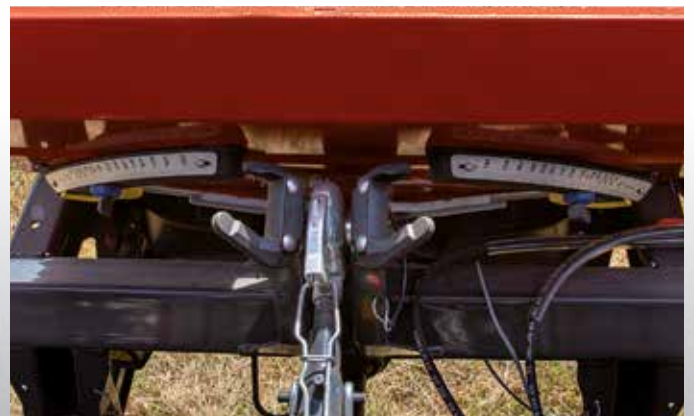
Easily visible DfC scales

Especially the slide position can be checked with the yellow pointer with a view from the tractor cab. That means it is not necessary to get out.